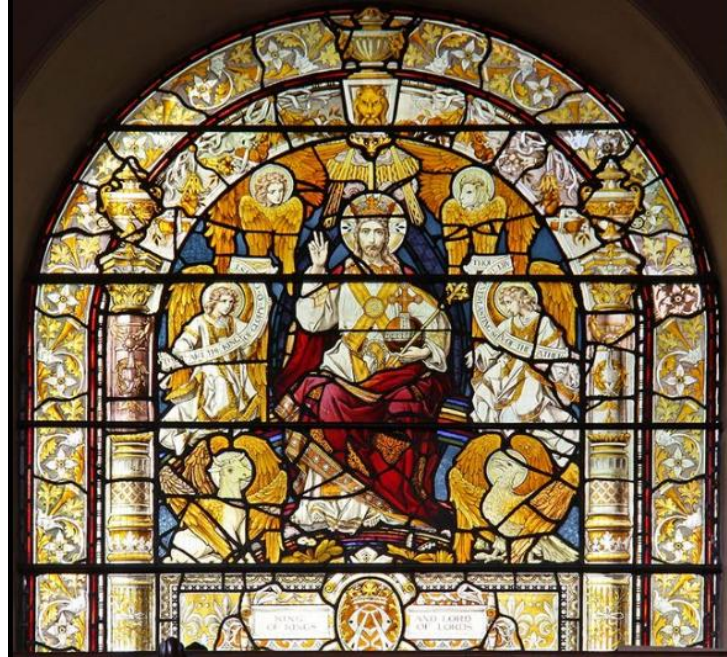
Christ the King, St Botolph without Aldersgate, London

https://commons.wikimedia.org/wiki/File:St_Botolph_without_Aldersgate_London_EC1_-_Window_-_geograph.org.uk_-_1209741.jpg ( Creative Commons Attribution Share-alike license 2.0 ) ( )